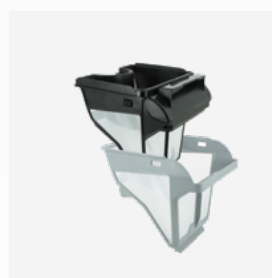
Filter canister Dual stage filter: 150/60 µ